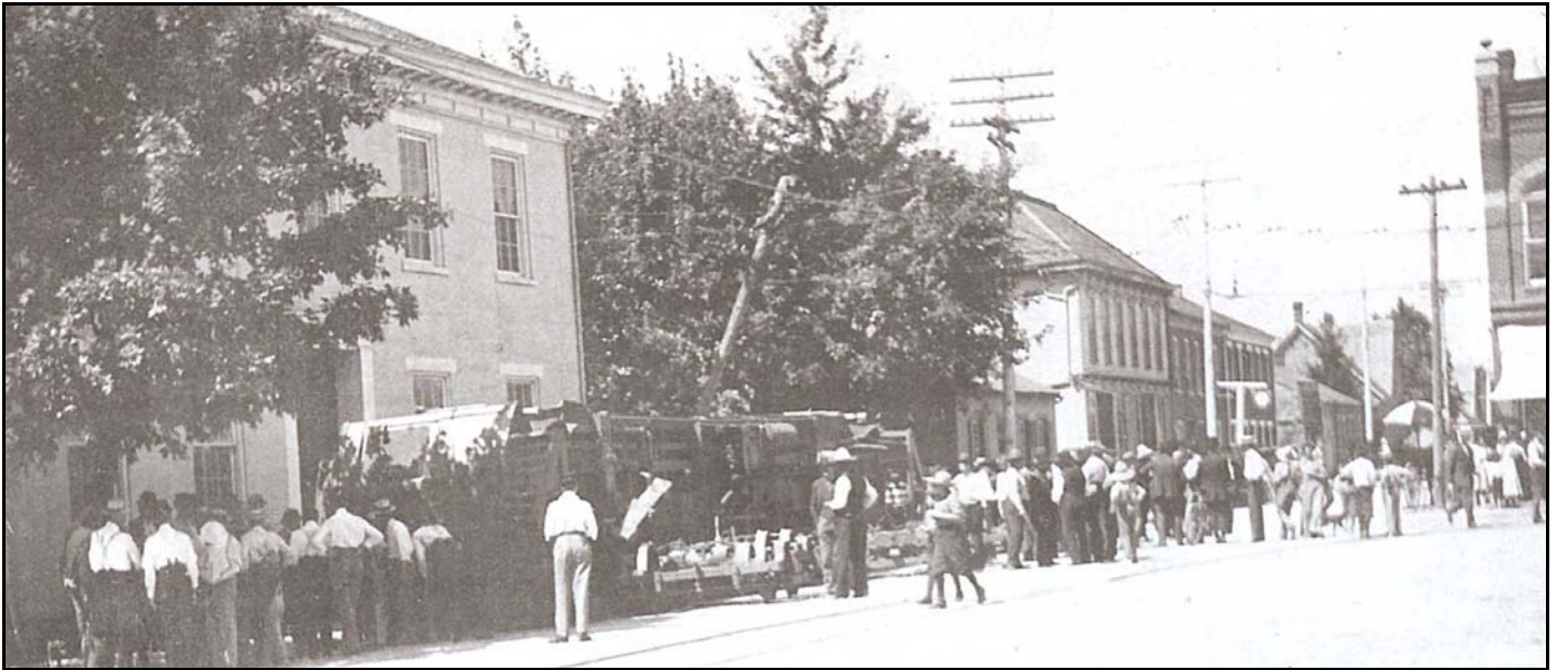
July 17, 1909 – Interurban car overturned at corner of West Monroe & Main Streets

HENRY WUEBBENHORST, 47 MARIE WUEBBENHORST, 5